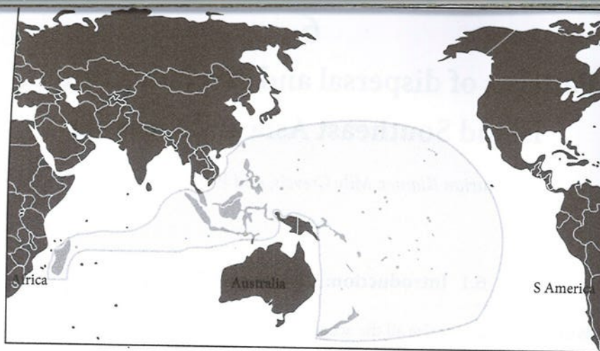
Map 6.1 Spread of Austronesian languages